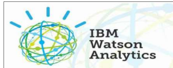
Fig 5: IBM

Watson is an IBM supercomputer that combines artificial intelligence (AI) and complex programming to act as a fully responsive tool. The supercomputer is named in honor of IBM founder Thomas SJ Watson. IBM Watson was at the beginning of a new computing era when IBM Watson was created. Find and Create Find and Evaluate Theory Check and Combine and Predict Rank. "Recently, Watson's limitations have been increased and the way Watson works has moved to a new, distorted delivery model (IBM Cloud Watson) and encouraged a new delivery model (IBM Cloud Watson) with machine learning capabilities and updated hardware for updated hardware." agency. It is no longer a question that responds to organized search engines outside of participating in questions and answers, but now it is "see", "hear", "read", "speak", "try", "translate", "learn" "... I know" and "I am certified".