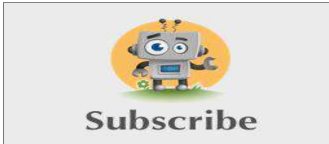
Fig 7: Subscribe