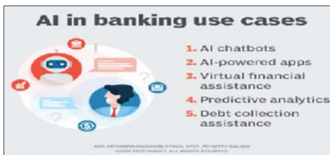
Fig 4: AI in banking use cases

Referring to the Tech Target articles that describe each industry in detail, here is an example of the use of artificial intelligence in many industries and business sectors.