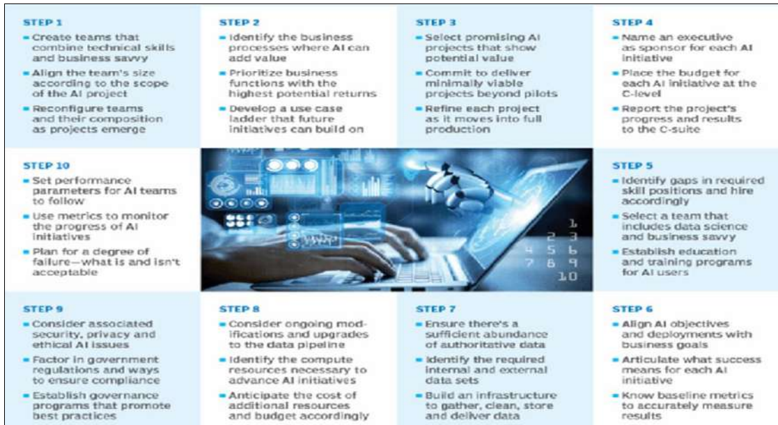
Fig 2: Executive's step-by-step guide to building a viable AI strategy

edge. Meanwhile, AI's ability to make meaningful predictions is to reach the truth. Instead of imitating human prejudice. This requires more than just storing large amounts of data. But a high-quality cloud computing environment enables AI applications to provide the computing power needed to process and manage big data in a scalable and flexible architecture but also covers a wider range of users in the organization.