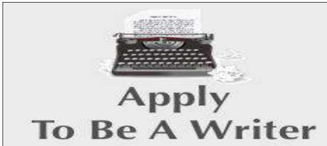
Fig 8: Apply to be a writer